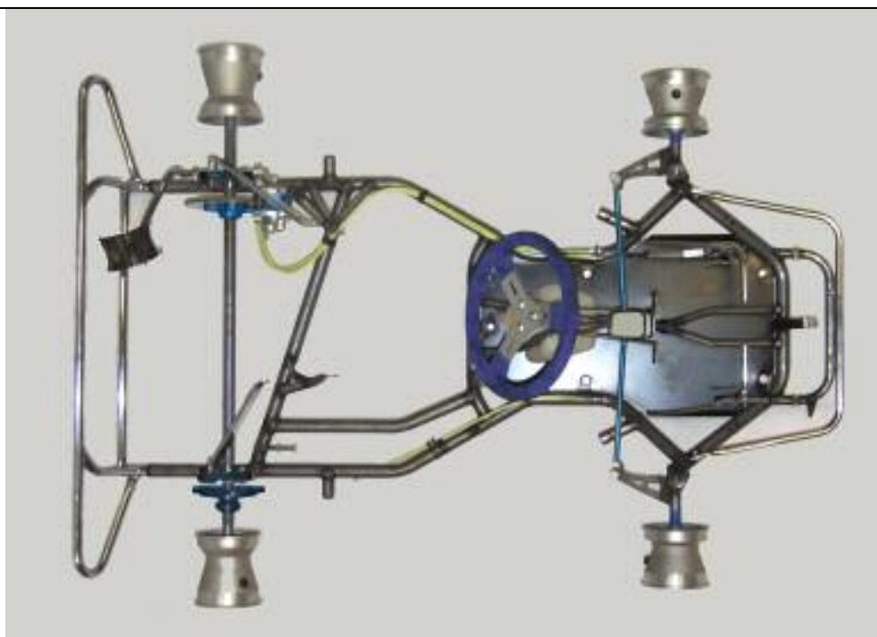
Photo of complete chassis less seat, tyres and bodywork

This Homologation Form reproduces descriptions, illustrations and dimensions of the chassis at the moment of the MSA homologation. The Manufacturer may modify them, but only within the limits set by the MSA regulations in force and with the written agreement of the MSA.